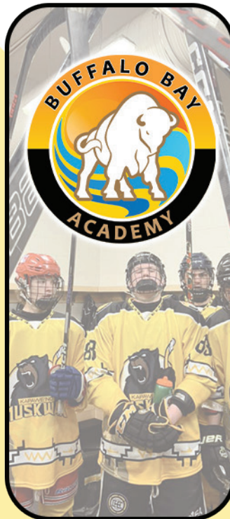
BUFFALO BAY ACADEMY 7-12 SAKAMOOSTOS WASAW