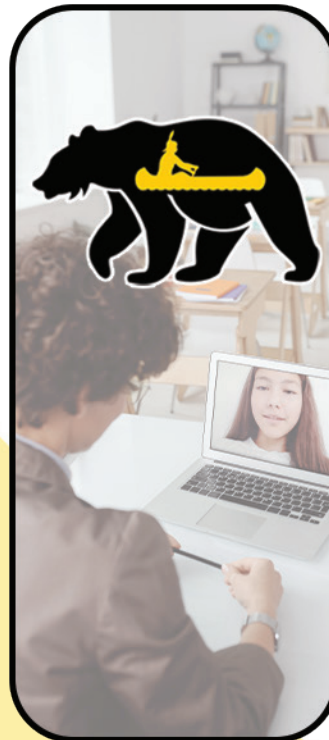
FIRST NATION VIRTUAL LEARNING CENTRE (FNVLC) KASKAPATEW PEKISKWEWIN