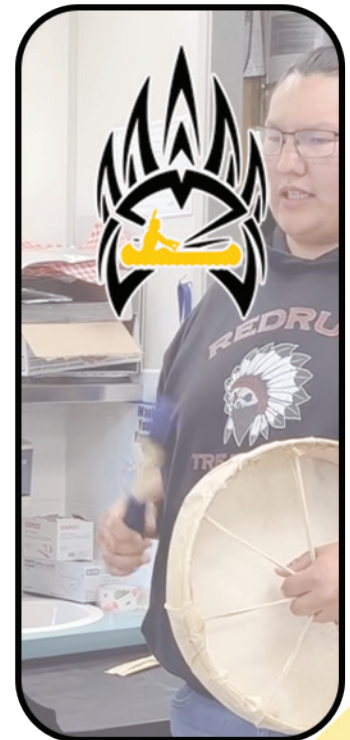
OUTREACH/ADULT LEARNING KAPAWE'NO KASKITAYANIH-KA SKIH TAH YA NIH