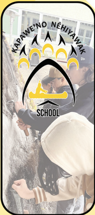
KAPAWE'NO NÊHIYAWAK SCHOOL K-6 (KNS)

We have four pillar schools under our Kapawe'no First Nation Collegiate which are: